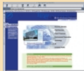
● Official Home Page

This is an engineering ASP (application service provider) site that provides support for the facilities of processing industries throughout their life cycle. Besides distributing engineering applications, we offer procurement services and consultation services.