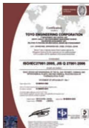
ISO/IEC 27001 Certificate of Approval