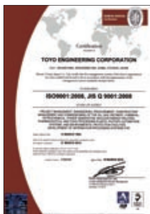
ISO 9001 Certificate of Approval

Similarly, in March 2006, Toyo-Japan obtained Information Security Management Standard BS7799 certification. Considering Standard upgrade, ISO/IEC27001: 2005 certification has been renewed.