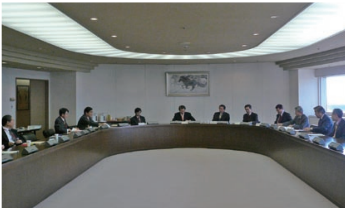
Meeting of SQE Committee for Corporate SQE management