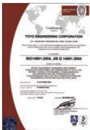
ISO 14001 Certificate of Approval