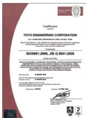
ISO 9001 Certificate of Approval

Toyo, in March 1994, acquired Quality Management Standard ISO 9001:1987 certification from the United Kingdom Accreditation Service (UKAS) and the Japan Accreditation Board for Conformity Assessment (JAB). After that year and now, Toyo passed the Transition Assessment for ISO 9001:2008.