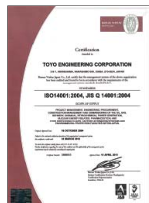
ISO 14001 Certificate of Approval

In October 2004, Toyo obtained Environmental Management Standard ISO 14001:1996 certification, which covers the Head Office and domestic construction sites. After that year and now, Toyo passed the Renewal Assessment for ISO 14001:2004.