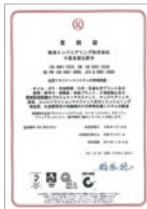
ISO 9001 Certificate of Approval

In October 2004, Toyo obtained Environmental Management Standard ISO 14001:1996 certification, which covers the Head Office and construction sites within Japan. The certification was given by UKAS and JAB. In March 2009, Toyo passed the second Renewal Assessment for ISO 14001:2004.