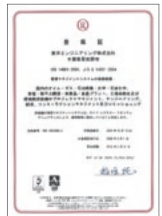
ISO 14001 Certificate of Approval