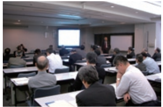
Closing meeting of LRQA's surveillance

In activities not related to ISO certification, Toyo is making preparations for conducting OHSAS 18001, an international occupational health and safety management system specification.